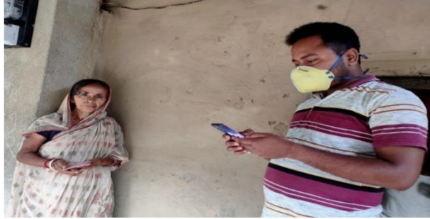
Providing information about covid-19 to the beneficiary