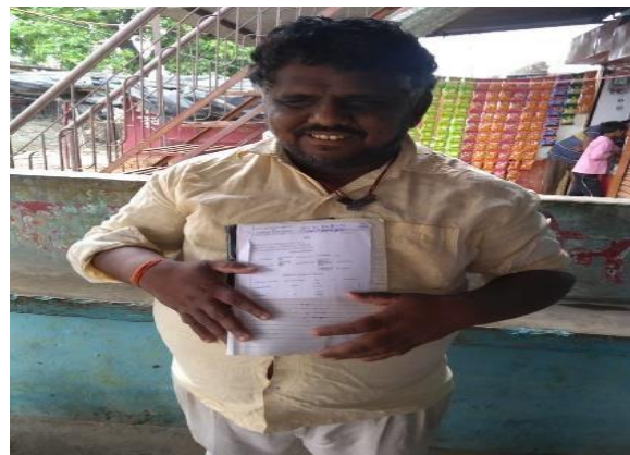
Beneficiary providing information about

This was the first experience of online concurrent audit for the social audit unit and it gave the opportunity to the team to understand a lot about the process, provisions, problems and solutions regarding the audit. Many problems were resolved quickly with the active contribution of State Food Commission and participation of Panchayat representatives. The District Grievance Redressal Officer has taken cognizance of more than 303 individual complaints and the State Food Commission has taken cognizance of 3917 cases by the group. Due to this process the importance of regular social audit was felt and realised.