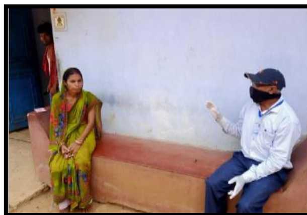
Providing Information about COVID-19 during concurrent audit

Three types of food security schemes have been included in the process with 4428 families involved in this audit, which includes Public Distribution System (PDS), Integrated Child Development Services or Anganwadi centres (ICDS), and Mid Day Meal scheme (MDM).