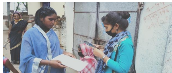
Audit with a woman beneficiary

From the above data, we found that out of the total 147 families, maximum families from Simdega(14.7%) and Giridih(12.4%) did not receive prescribed quantity of nutritional supplements from Anganwadi centre.