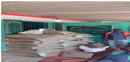
Public Distribution shop