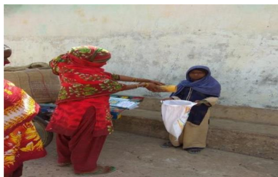
Receiving food grains under Mid Day Meal Scheme

From the above data of concurrent audit, we found that children from 1767 families studying in class 8 or below received Mid Day Meal ration whereas the children from 2661 families do not belong to this age group.