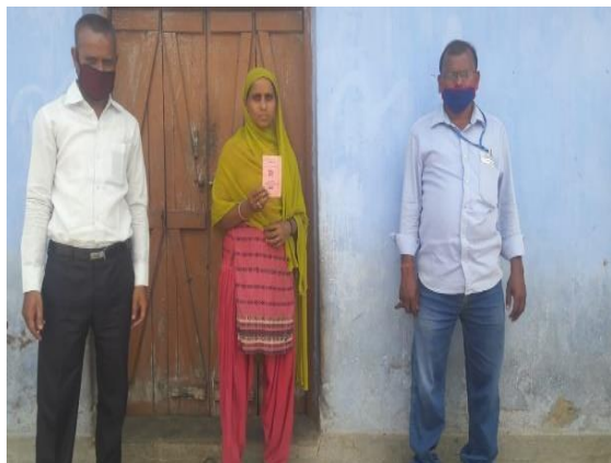
A beneficiary showing her ration card during audit in Hazaribagh District