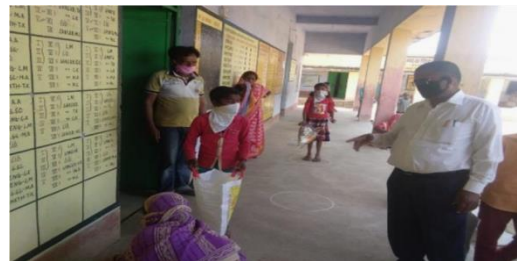
Child receiving mid day meal food grains from School