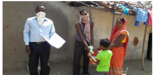
Children Receiving Ration Under MDM Scheme

From the above table, we found that out of 353 families, 27.3% families in Godda and 14.9% in Giridih did not get ration under Mid Day Meal Scheme(MDM).