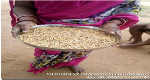
Didi showing the nutritional supplement received from Anganwadi centre